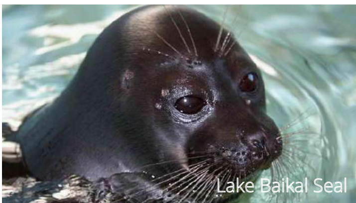
Lake Baikal Seal

Recognizing the importance of Baikal for the Irkutsk Region and the entire planet, INRTU perceives the importance of saving Baikal and its unique nature with endemic species of fish and animals and rare plants in a state of nature for future generations and protecting the lake from harmful human influence. For these reason, INRTU is committed on establishing effective educational programs and doing research in the field of ecology and green engineering.