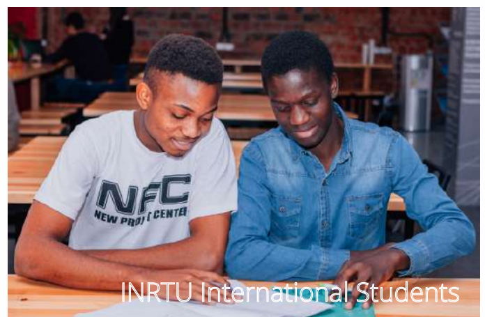
INRTU International Students

An integral part of the educational process and research activities in INRTU are numerous field trips and expeditions, scientific and practical seminars, conferences and symposiums thank to which students have the opportunity not only to learn from eminent scientists, but also to give a good account of themselves in a scientific field under the supervision of experienced professors.